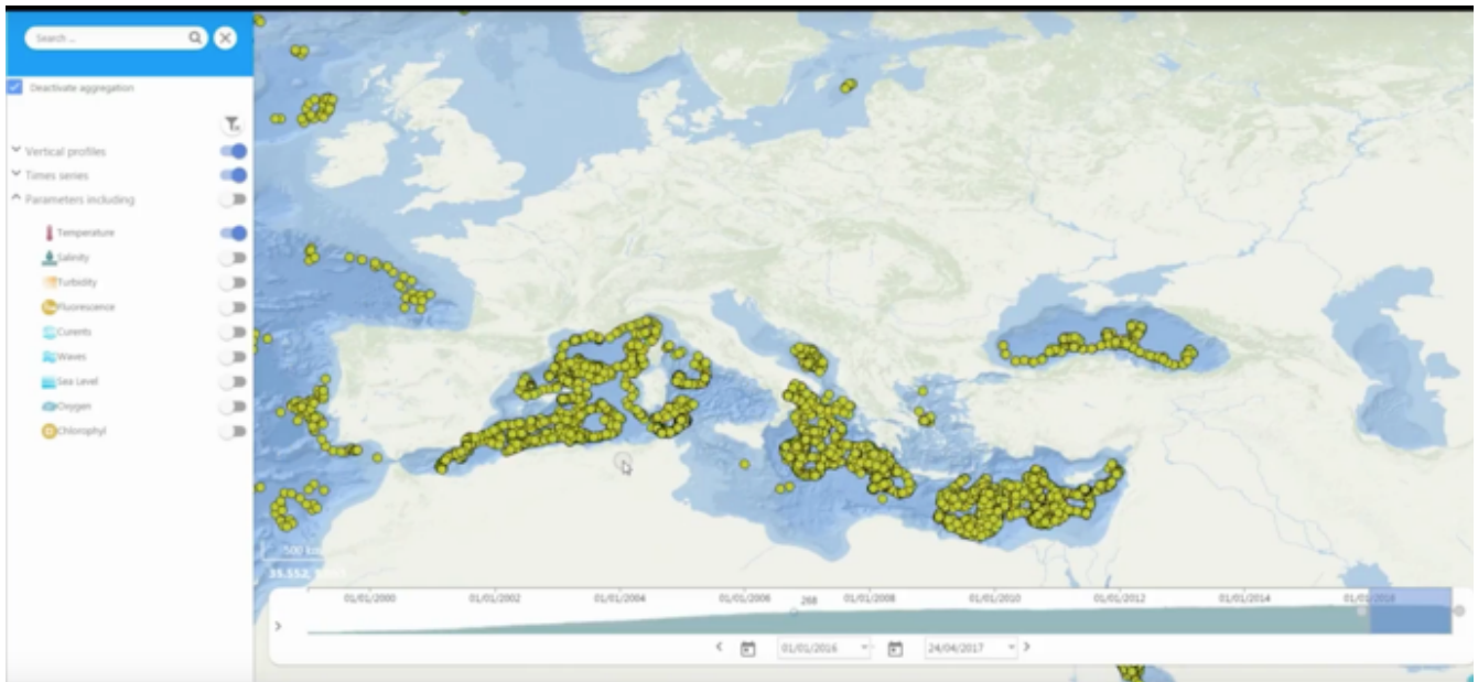
Figure 2. DSS Web portal