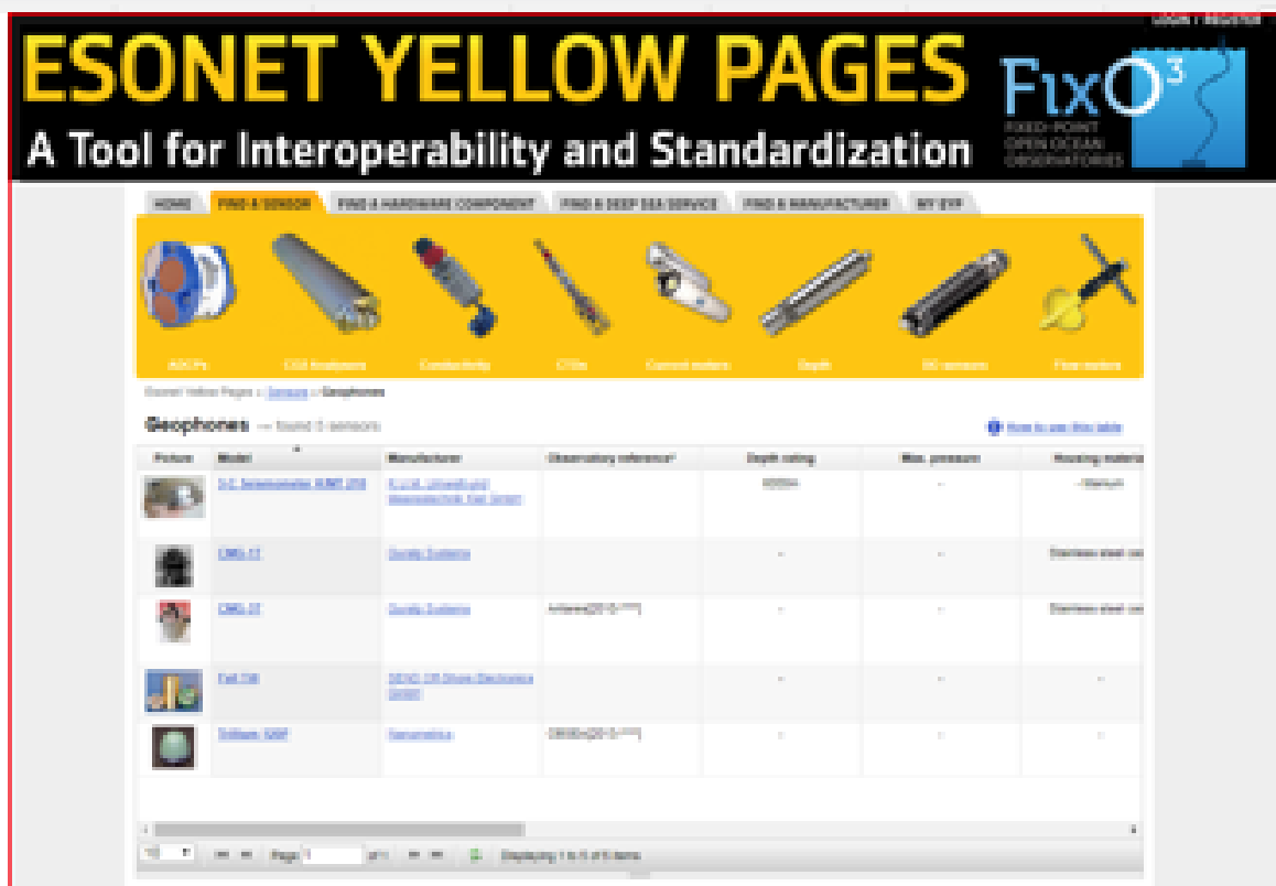
Figure 10. Sensor Deployment Graphical Editor and Sensor Model Database for EMSO